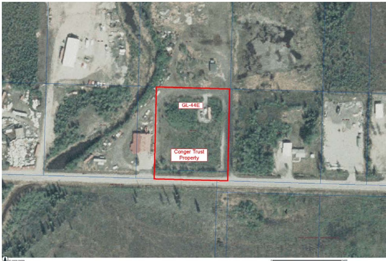
View of Conger Trust property North of Cartwright Road

The Arthur T. Conger Living Trust owns Government Lot 44E of Section 20, Township 1 South, Range 1 West, Fairbanks Meridian. The parcel is located at 3450 Van Horn (Cartwright) Road. Government Lot 44, a 2.5 acre parcel was patented to William L. Ault according to Patent No. 1189388 on December 16, 1958. The patent was specifically subject to a 33-foot wide right of way for road and utility purposes along the south and east boundaries of the lot.