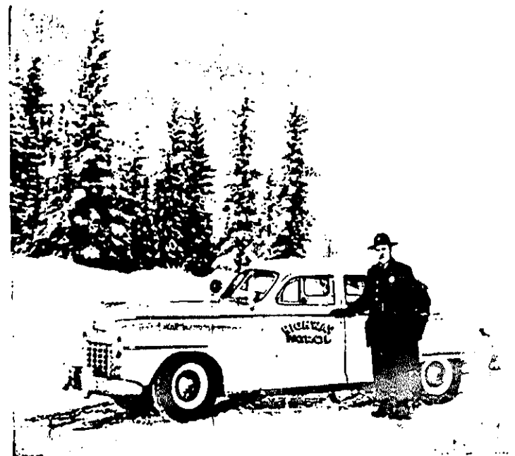
HIGHWAY PATROL CAR—FAIRBANKS

The 1947 Legislature granted to the Alaska Highway Patrol full police powers and the authority of a U. S. Marshal. They also have been appointed Deputy Game Wardens by the Fish and Wildlife Service with the powers of search and seizure. For this reason the Board has maintained a high standard of qualification. The salaries range from $380 to $460 per month, depending upon locality and length of service, which is paid out of the Motor Fuel Tax Fund. Each Patrolman is furnished with a servicable uniform and fully equipped for the duties he has to perform. The cars they drive are of standard make and easily discernible by the insignia of the Force.