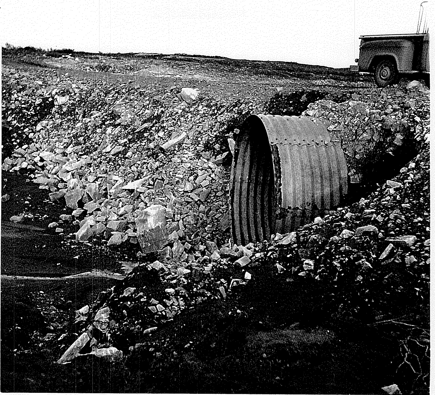
Fig. 34-C None-Solomon; maximum fill with multi-plate CRP culvert.