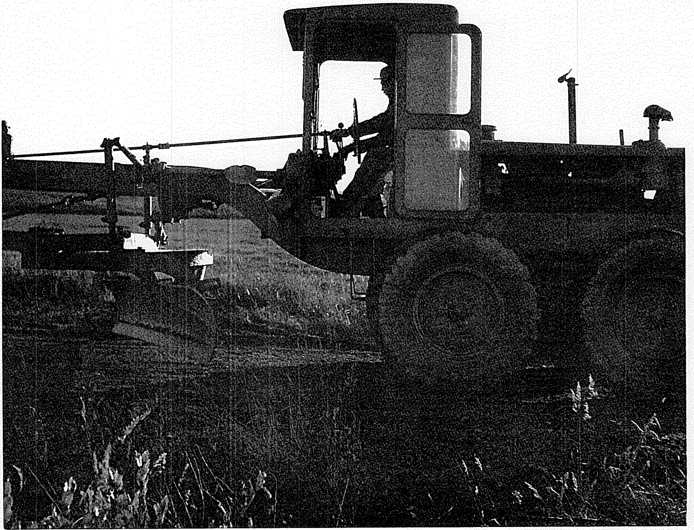
File 100-100000 Caterpillar #113 motor grader maintaining haul road from pit to bridge site.