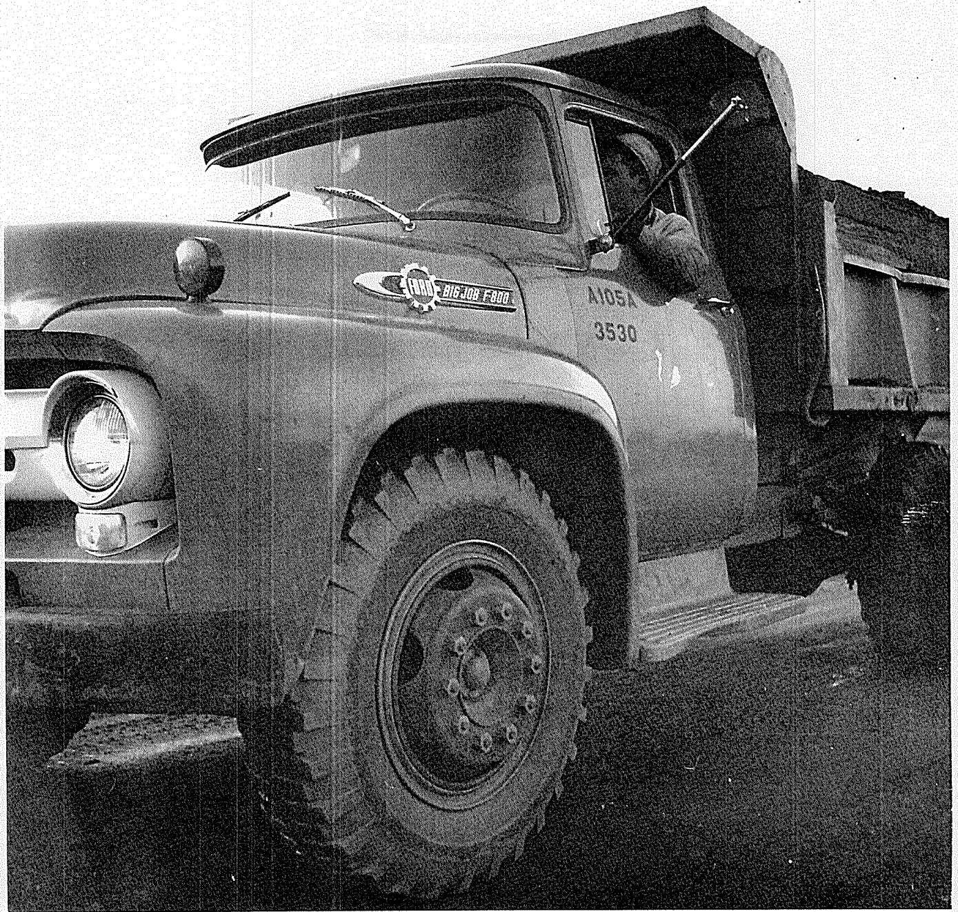
Fig. 24-11 Non-Solomon; new Ford dump truck.