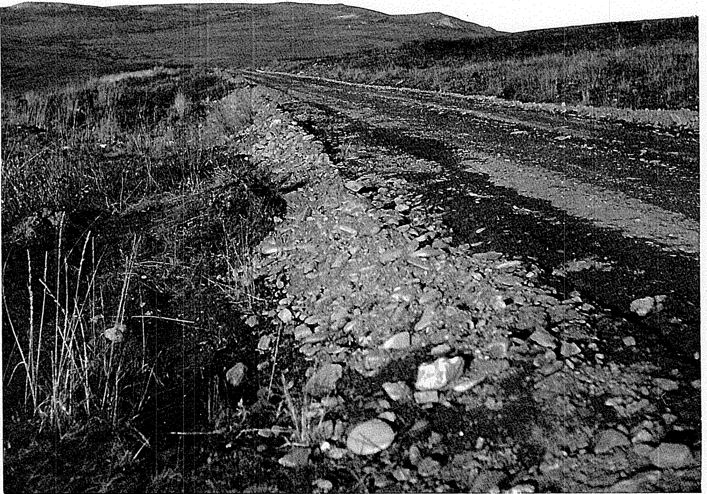
Fig. 34-F Nono-Solomon; typical section of improvements to river road.