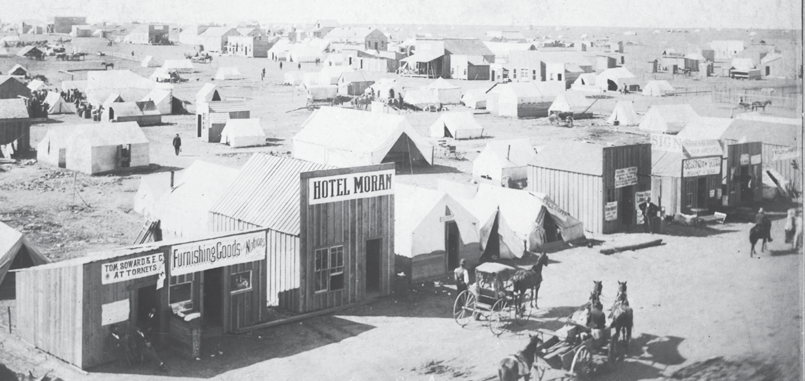
Opposite: In 1887, Congress made more land available by opening the remaining Indian lands to settlers. A poster advertises the opening, which led to the “land rush” in Oklahoma. Above: The Oklahoma District was opened for settlement at noon on April 22, 1889, and new towns like Guthrie (above in 1893) arose quickly.

California, Washington, and Oregon were opened to cash purchase, and great landed estates were established in this way.