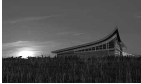
The Homestead Heritage Center, Homestead National Monument of America, in Beatrice, Nebraska, hosted celebrations of the 150th anniversary of the Homestead Act.

For the next three years, Indian agents did nothing, knowing that any settlement would doom the whole reservation system. During that time, “boomers” continued moving into the areas. Western pressure forced the Indian Office in Washington to act. In January 1889, the Creeks and Seminoles were forced to surrender their rights to the Oklahoma District in return for cash awards of nearly 4.2 million dollars. Two months later, Congress