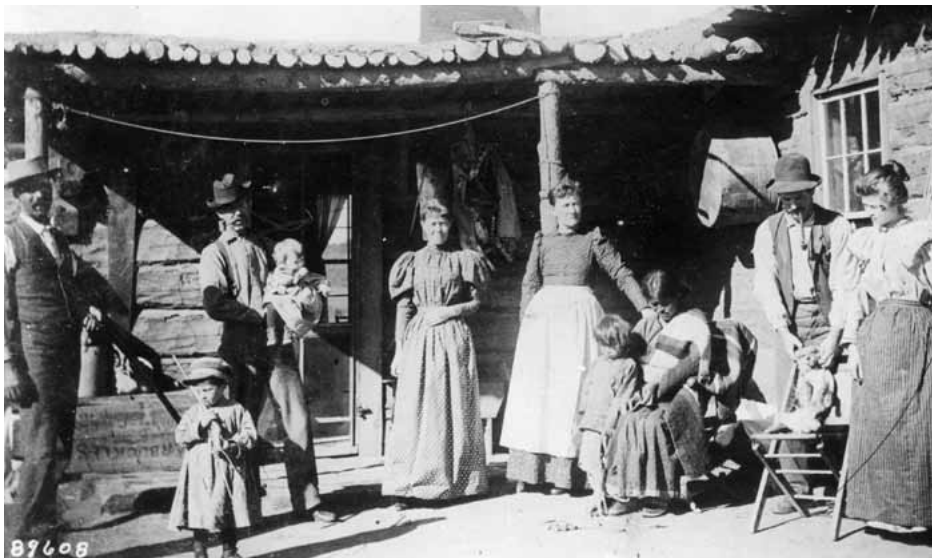
Above: Thousands of settlers waited at Kiowa, Oklahoma, on July 29, 1901, amid freight cars and wagons for a drawing for the right to homestead. Other sections were opened to land rushes. Below: Homesteaders in New Mexico, undated. Although much of the better land had been acquired between 1862 and 1890, good land in the West still remained, and the westward movement continued after 1890.

and work was made that much harder. Summer also brought grasshopper invasions in some years. The worst was in 1874, when the Great Plains from Dakota to northern Texas was devastated.