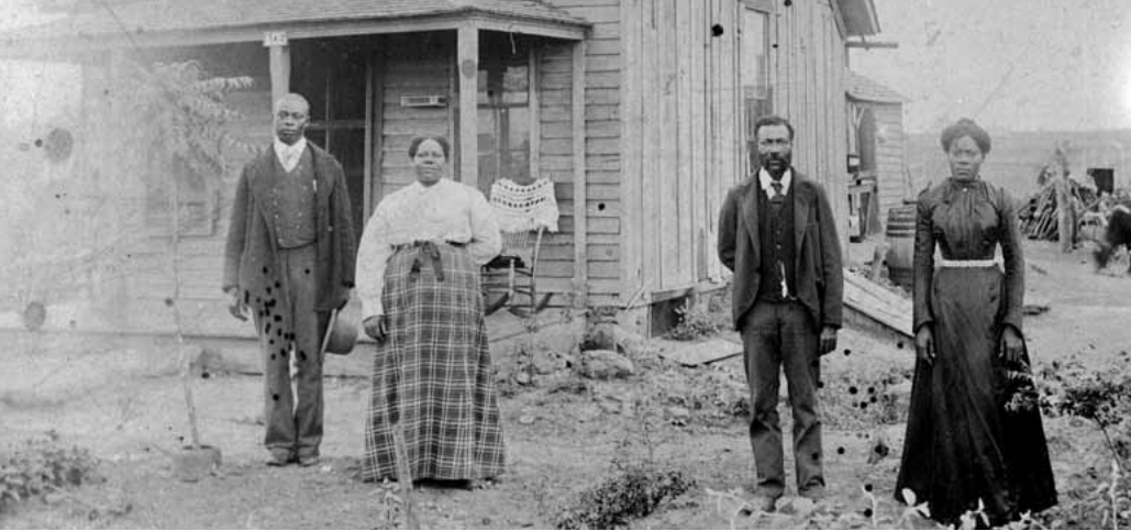
Above: African Americans settlers in Nicodemus, Kansas, after Reconstruction. Up to 27,000 ex-slaves had migrated to northern Kansas by 1879. Below: Charles and Caroline Ingalls of Wisconsin moved west, filing on a 160-acre homestead one mile from De Smet, South Dakota, in February 1880, where they opened a store. Their daughter Laura Ingalls Wilder wrote about her homestead experiences in the series of "Little House" books.