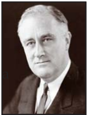
President Franklin Roosevelt

The 1898 law allowing homesteading in Alaska was amended on March 27, 1927, under President Calvin Coolidge. It created a new category of land claim also called “homestead.” A further amendment under President Franklin Roosevelt on May 26, 1934 added additional terms. Under these laws, people could claim up to five acres without doing any cultivation of the land. Two types of claims were possible. One was for a dwelling called a “homestead” and the other was for business purposes. To receive the five-acre dwelling type “homestead” (later called a “homesite”), claimants had to live on the land for three years, have a habitable dwelling, and pay $2.50 per acre at the end of the proving up process. For the business site five-acre claim (sometimes also called a “homestead” but later termed “headquarters site”), people had to show that the full amount of land (up to five acres) was needed for business purposes. Claimants also paid $2.50 per acre and could not receive title to the land until three years had passed during which they were using the land for business needs. People were also allowed to get one each of both types of five-acre special “homesteads” by meeting requirements for both, for a total of up to 10 acres.