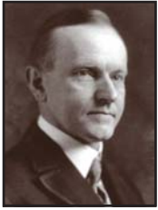
President Calvin Coolidge

The 1898 law allowing homesteading in Alaska was amended on March 27, 1927, under President Calvin Coolidge. It created a new category of land claim also called “homestead.” A further amendment under President Franklin Roosevelt on May 26, 1934 added additional terms. Under these laws, people could claim up to five acres without doing any cultivation of the land. Two types of claims were possible. One was for a dwelling called a “homestead” and the other was for business purposes. To receive the five-acre dwelling type “homestead” (later called a “homesite”), claimants had to live on the land for three years, have a habitable dwelling, and pay $2.50 per acre at the end of the proving up process. For the business site five-acre claim (sometimes also called a “homestead” but later termed “headquarters site”), people had to show that the full amount of land (up to five acres) was needed for business purposes. Claimants also paid $2.50 per acre and could not receive title to the land until three years had passed during which they were using the land for business needs. People were also allowed to get one each of both types of five-acre special “homesteads” by meeting requirements for both, for a total of up to 10 acres.