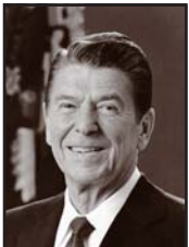
President Ronald Reagan

Alaska's homestead experience represents the final chapter in the longer Homestead Era that began in 1862 in American history, five years before Alaska even became a part of the United States. Relatively few homesteads were awarded in Alaska between its start in 1898 and end in 1986 when Ronald Reagan was President. Homesteading remains important to many Alaskans today, and many homesteaders or their families still own original claims. Nationwide, over 1.6 million homesteads were granted in 30 states, with hundreds of thousands of homesteaders and their families getting an economic boost in America through receiving federal land for "free" as homesteads. The terms for granting homesteads in certain states other than Alaska left the federal government with ownership of the mineral subsurface or other special land management situations. Homesteading truly played an important part in creating the Nation we have today. Some remains of older homesteads are now being managed as historic archaeological sites.