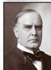
President William McKinley

Homesteading in America began when President Lincoln signed the 1862 Homestead Act enabling over 1.6 million people to claim federal land intended for small farms. Homesteaders included men, women, freed slaves, and European settlers. During the homestead era, about 270 million acres of federal land were claimed in 30 states, from Florida to Michigan to Alaska. This is over one-tenth of all the land in America. Descendants of homesteaders today are estimated at about 93 million Americans, with many thousands still living on farms claimed by their ancestors.