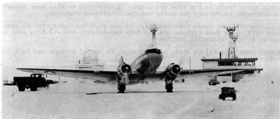
AIRPLANES PROVIDE MANY SERVICES FOR MEN STATIONED AT THE SITES

The Yukon River, historic route of gold rush sourdoughs and the "main street" of northern Alaska, flows near Campion AFS, about 240 miles west of Fairbanks.